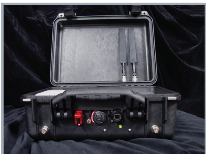
CAMMS™ DFK exterior

"Quick and easy deployment whether to extend a mesh or add an IP video camera to the mesh."